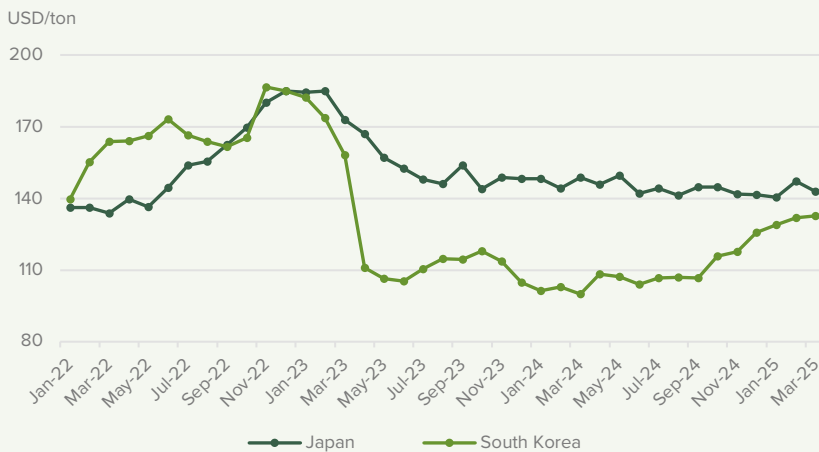
Figure 1: Monthly wood pellet export price in key markets

Compared to 2023, the export price of wood pellets continued to decrease in 2024. In 2024, the average export price of wood pellets reached about 133.5 USD/ton, down 8.2% compared to 2023. In the two main markets, Japan and South Korea, the average export price of wood pellets reached about 144.3 and 109.2 USD/ton, respectively, in 2024. However, in contrast to the slight decrease in the Japanese market, the average import price in the Korean market has increased significantly since September 2024.